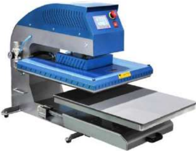
Star Air Fusion - P