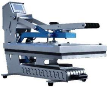
Star Auto Clam - AS