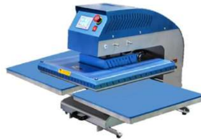
Star Air Fusion Dual - DP