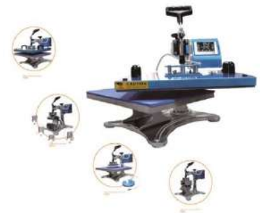
Star Luxury Combo 8-in-1(3343)