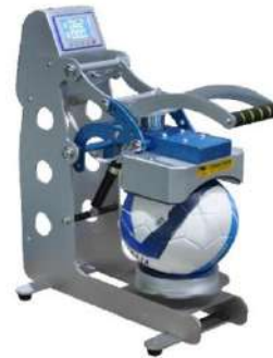
Star Ball Press