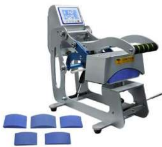
Star Cap Press