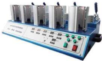
Star Mug Press 5-in-1