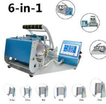
Star Magnetic Mug 6-in-1