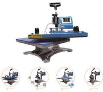
Star Luxury Combo 8-in-1(2938)