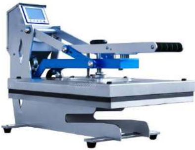
Star Auto Clam - A