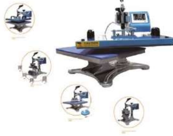
Star Luxury Combo 8-in-1(3838)