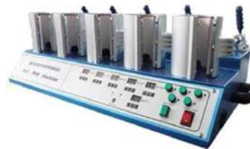
Star Multi Mug Press 5-in-1