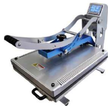
Star Auto Clam - CS