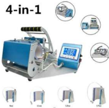
Star Magnetic Mug 4-in-1