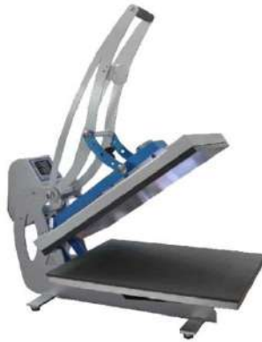
Star Auto Clam - B