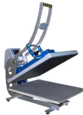
Star Auto Clam - C