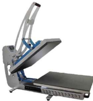
Star Auto Clam - BS