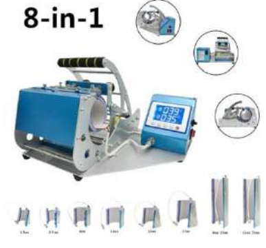
Star Magnetic Mug 8-in-1