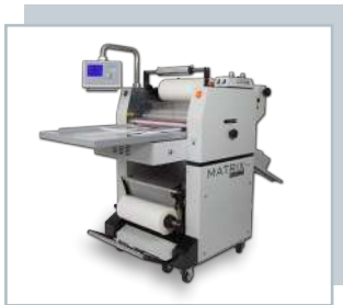
MATRIX DIGITAL FOILING & LAMINATING SYSTEMS

• Yes - No S Special order Non-exhaustive list. Consult us for full stock and availability.