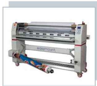
EASYMOUNT WIDE FORMAT SYSTEMS