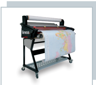
LINEA ENCAPSULATION SYSTEMS