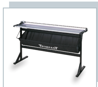
TRIMFAST TRIMMING & CUTTING SYSTEMS