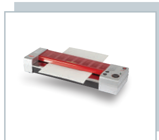
PEAK POUCH LAMINATING SYSTEMS