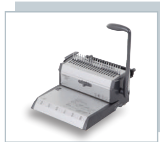
MAGNUM BINDING SYSTEMS