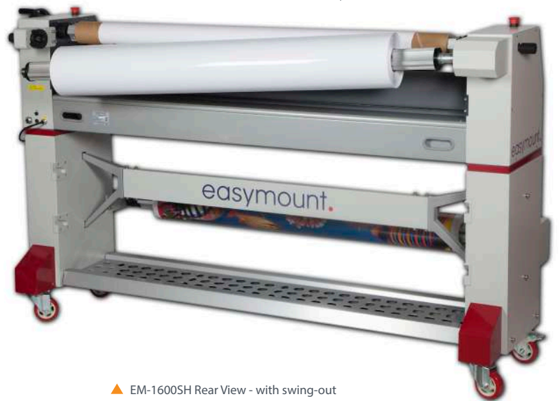
▲ EM-1600SH Rear View - with swing-out arm for loading laminate

The arms makes loading both vinyl and media a whole lot easier and less time-consuming, with no compromise on the finish.