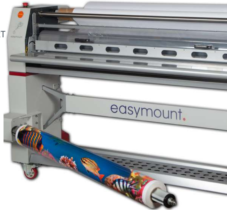
▲ EM-1600SH - with swing-out arm for loading vinyl

Designed in-house by Vivid, the Easymount range gives your business extra capacity by allowing you to offer your customers a complete service that you previously had to outsource.