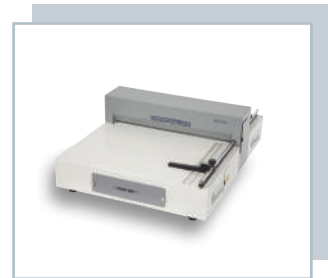
MAGNUM CREASING SYSTEMS