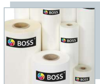
BOSS FILM SUPPLIES

Vivid design and manufacture a wide range of laminating systems, specialising in function, style and reliability.