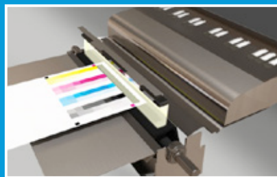
Full Width Array (FWA)

Automated Image-to-Media ensures perfect image alignment and front-to-back registration regardless of sheet size or media type – saving time and eliminating costly waste due to mis-registration or image skew.